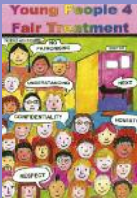
Inderjit Mehroke, England